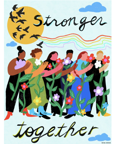
Art by Amplifier

BUT if many of us do something, we can get closer to a situation where abortion is accessible to anyone who needs it.