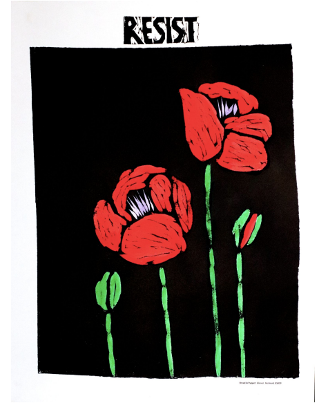
Art by Bread & Puppet

I recommend picking a couple of things that feel doable for you.